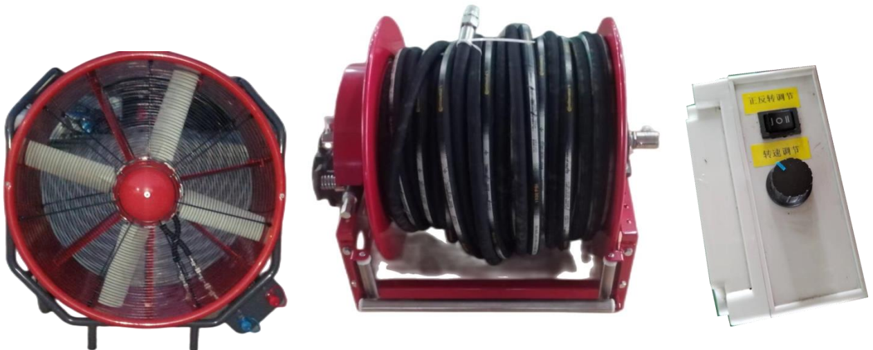
排烟机 Fume extractor

Note: The reel electric control box can adjust the reel rotation speed